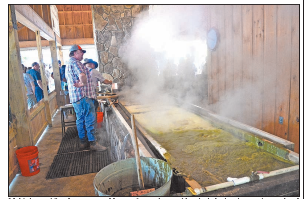
Makin' syrup! Sorghum syrup sold out as fast as they could make it during the opening weekend of the 48th Annual Blairsville Sorghum Festival.